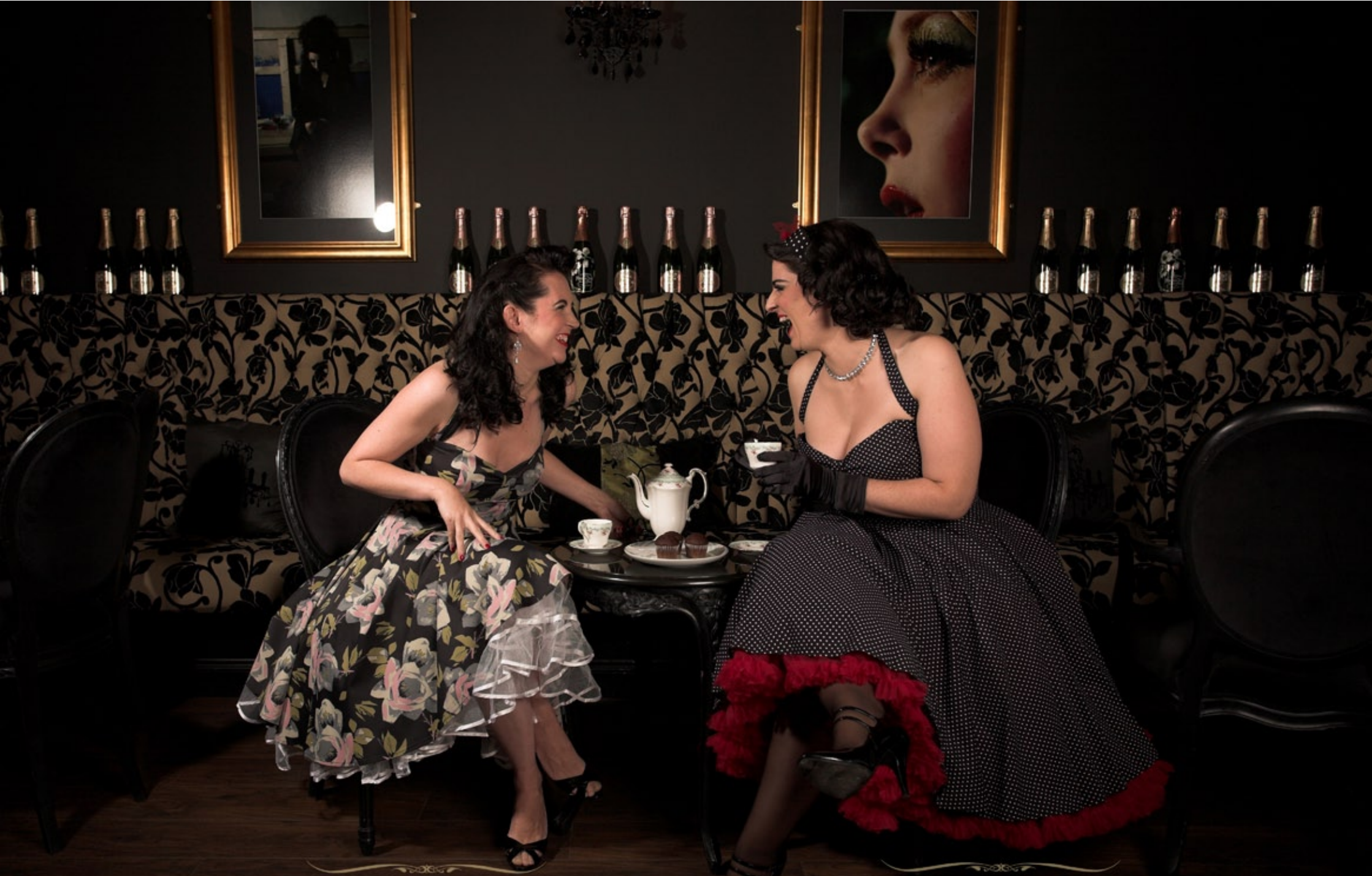
Clareq wears: 50s Floral Circle dress £69 White net petticoat £12